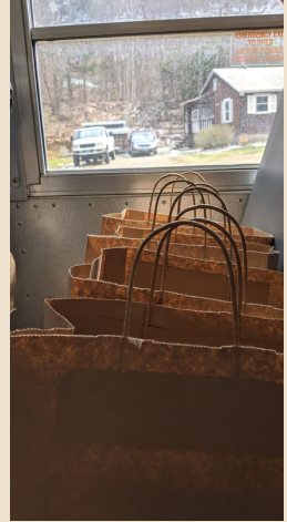
The farthest food items traveled only 87 miles while 7 of the 10 farms that provided food are located within 25 miles of Bellows Falls Union High School.